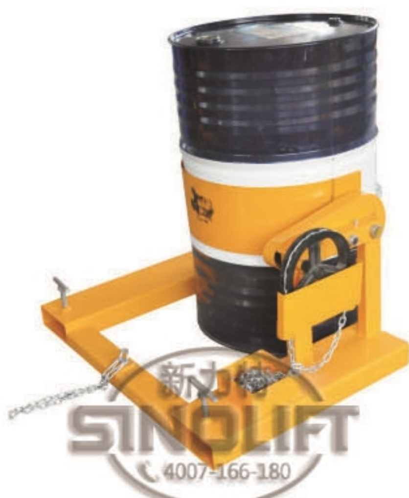
HK285A搬运夹 (链轮翻转) (Wheel chain flipping)