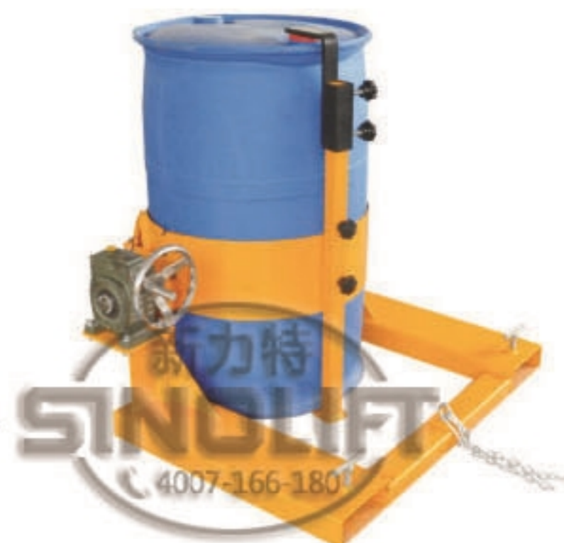
HK285C搬运夹 (蜗轮翻转) (worm gear flipping)