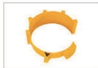
30加仑抱箍 30 gallon hoop