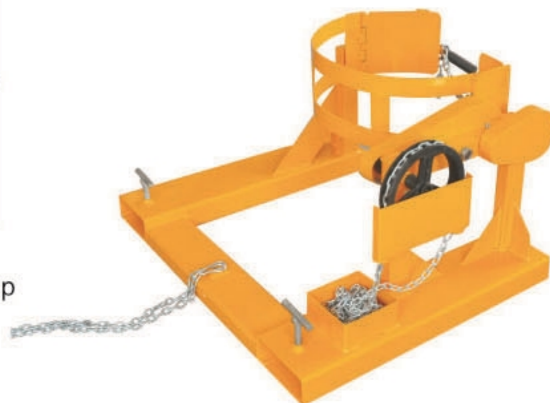
HK285B搬运夹 (重载链轮翻转) (Heavy-duty wheel chain flipping)