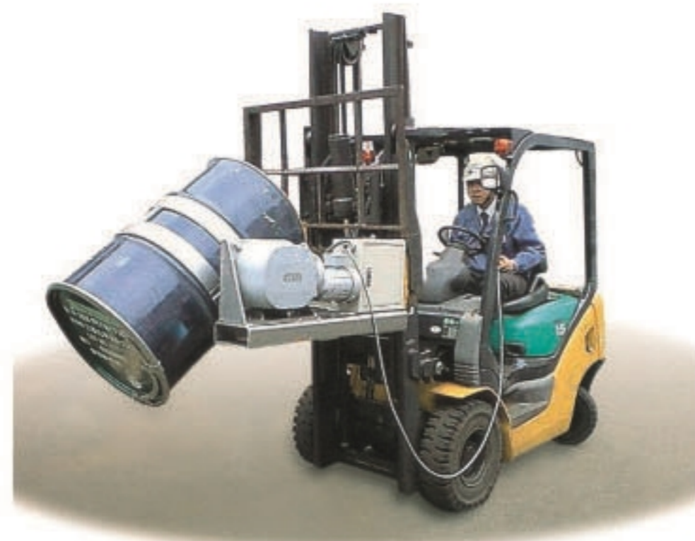
HK285D搬运夹 (电动多功能) (electric & multifunctional)