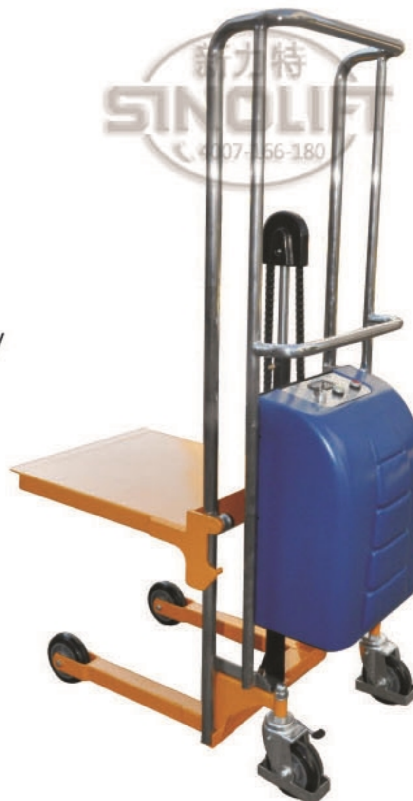
EP(L) 低平台 Low plate