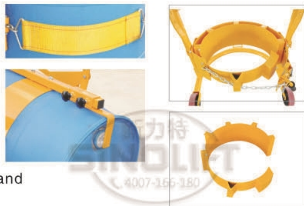
30加仑抱箍 30 gallon hoop